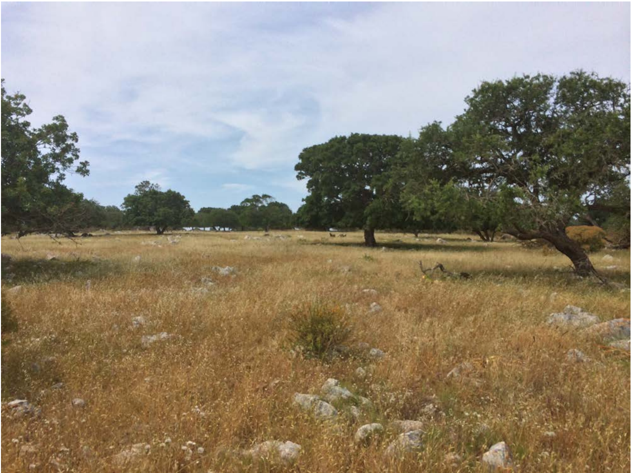
Fig. 1. Picture of the vegetation type Garrigue/Woodland on Protia Island, Greece. (Frisk, 2014)

Written by: Carl Frisk, Biology-Earth Science student of 2011