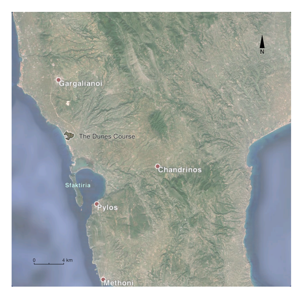
Figure 3. Map showing The Dunes Course areal in proportion to the southwest of Messinia (Google Earth, 2014). The North arrow, scale division, color modifications and the sketched distinguish of The Dunes Course position are done in Adobe Illustrator®.

This simplified map/image (Figure 3) is made to visualize the proportions of The Dunes Course in comparison to adjacent area, in this case the southwest of Messinia, Greece. This might give another perspective of the impact on the environment from The Dunes Course with more of an emphasis concerning the landscape-level. The area surrounding the course consists mainly of conventional olive groves.