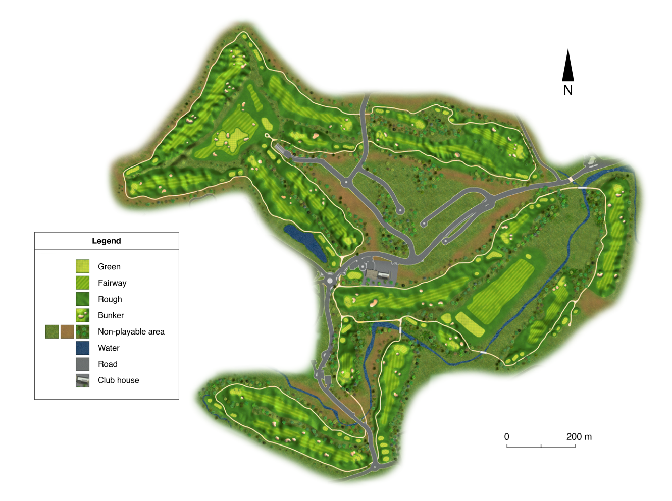
Figure 1 . Map over The Dunes Course and the golf course's features (Will Righton, 2014). Legend, north arrow and scale division are created in Adobe Illustrator ®.

Water conservation practices in place are: using correct nozzles, hand watering when possible, converting to part circle sprinklers where possible, seasonally adapted grasses are planted, Bermuda grass ( Cynodon dactylon ) in the summer and ryegrass ( Lolium sp. ) in the winter, only native plants throughout the unmanaged areas, and adapted to preferred vegetation zones. Also, oxygen improvement is in use, which is a process that is applied regularly to encourage the roots to grow deeper to get easier access to water. A machine makes small holes in the turf to get rid of dead organic matter (thatch), and then the turf gets top-dressed with sand. This process is done every two weeks.